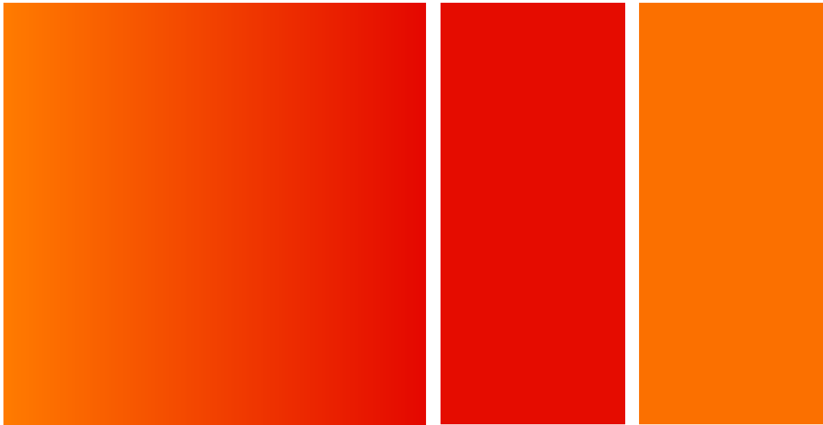
Hero Gradient #ff7000 @100% -- #e50700 @100%